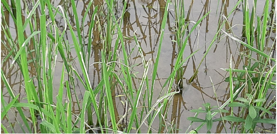
Case worm and leaf folder damage at Malan.