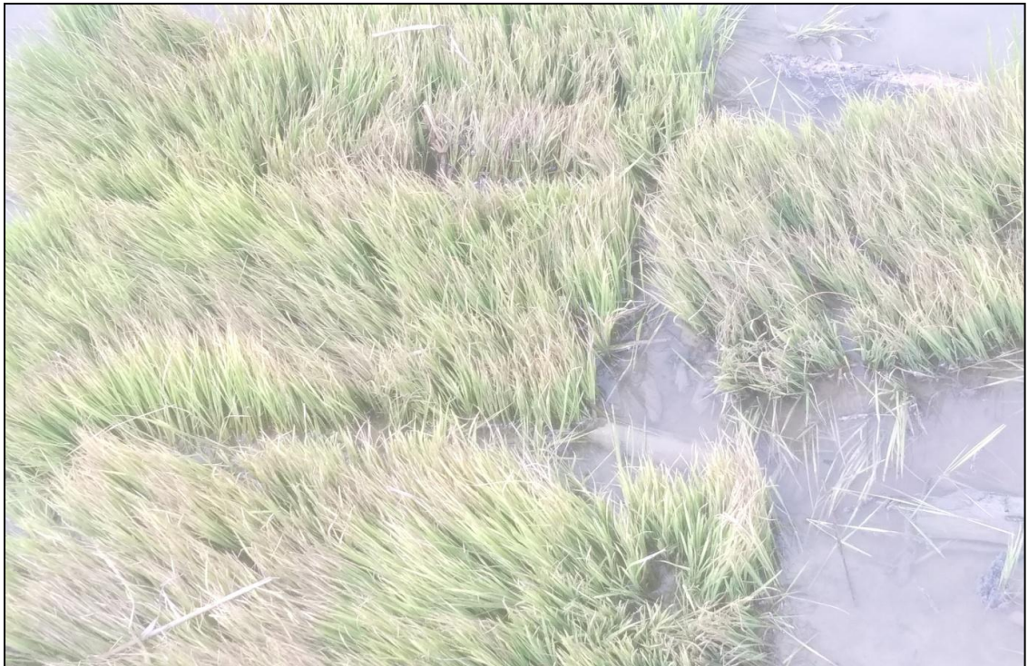
Thrips damage at Aduthurai