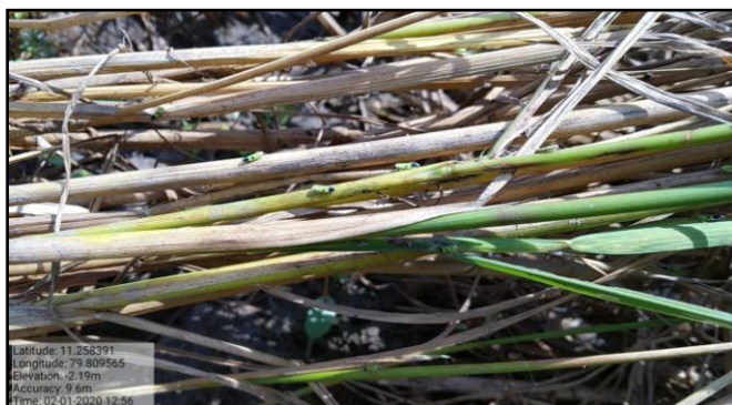
Green leafhopper incidence at Aduthurai