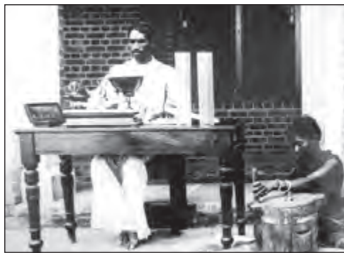
Analysis of head rice recovery using hand operated rice mill