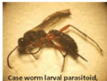
Case worm larval parasitoid, Apsilops scotinus