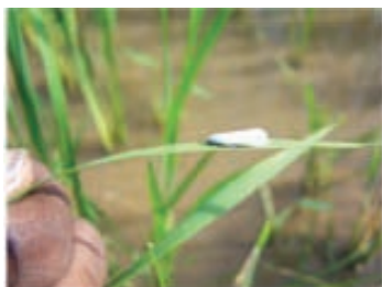
White stem borer, Chilo fuscifluora