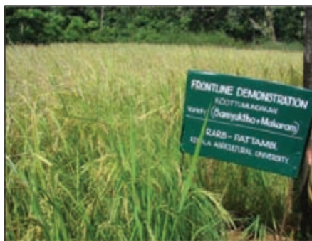
Photo-period insensitive, medium tillering variety of 112 - 117 days duration. This short-bold red kernelled rice variety is moderately resistant to major pests of rice crop. Released in 2010. It is non-lodging in the koottumundakan system of cultivation, with non-shattering grains and moderate dormancy.